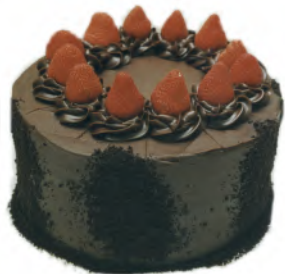
Strawberry Fraise Chocolate Layer Torte with Strawberries, Whip Cream, and Fudge. Available in 2 or 3 layers.