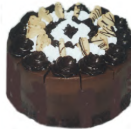
Triple Chocolate Torte Three layers Rich Chocolate With chocolate Mousse, Gnache, Whip Cream and Fudge.