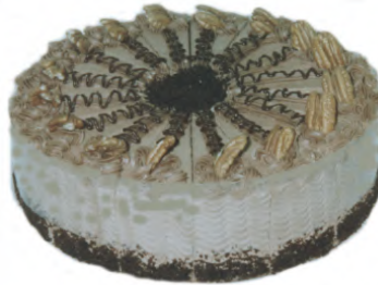
German Chocolate German Chocolate Cake with Coconut Pecan filling. Iced in Chocolate Buttercream. Available in 2 or 3 layers.

We can Slice All Cakes for you into 12 - 14 - or 16 portions Paper Tissues between Slices