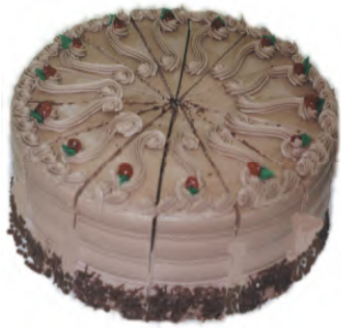
Chocolate Raspberry Chocolate Cake with Gourmet Raspberry filling and Chocolate Buttercream. Available in 2 or 3 layers.

We can Slice All Cakes for you into 12 - 14 - or 16 portions Paper Tissues between Slices