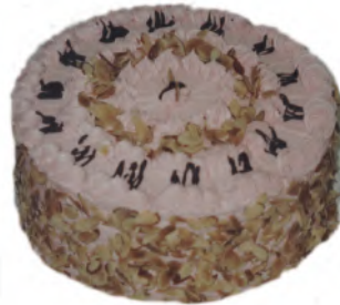
Strawberry Amaretto White Cake with Strawberry Filling. Iced in Strawberry Mousse. Available in 2 or 3 layers.